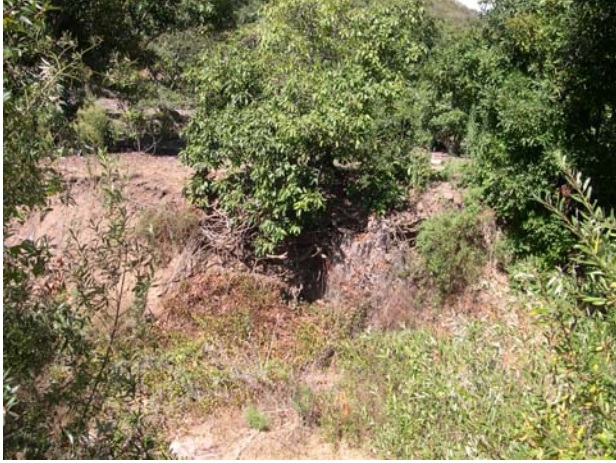
Cate School – Typical Area for Bank Stabilization