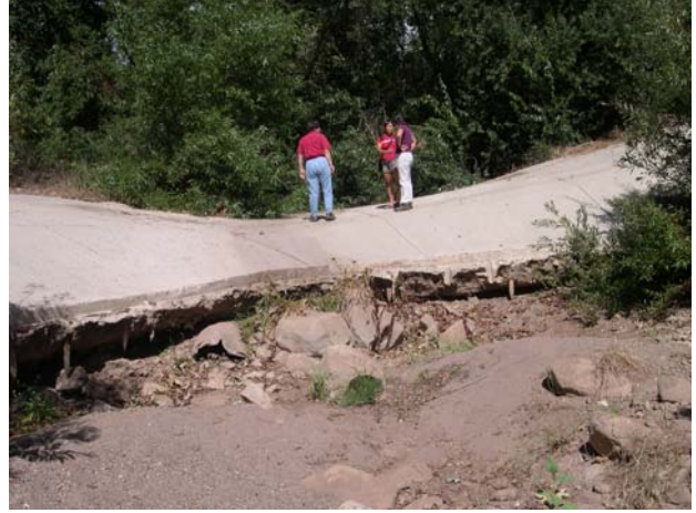
Low flow road crossing at Cate School

Designs call for the removal of the crossing, regrading of the creek and replacement with a prefabricated bridge. Because of scouring that has eroded the edges of the crossing, the structure is on the verge of failure and presents a hazard to vehicle passage as well as to downstream property during flood flows. The crossing provides the landowner's only available access to the other half of its property.